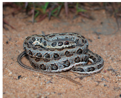
Figure 6: Ocellated skaapsteker ( Psammophylax rhombeatus ocellatus ).

One of the most common species of frog in the monitoring region, with a variety of color morphs. Originally described from Pungo Andongo on the Angolan central plateau, this species is widespread in the country (Ruas, 1996), extends east to central coastal Mozambique, and may comprise a complex of cryptic species. Other available names for Angolan material currently subsumed under T. tuberculosa include Rana cacondana and Rana signata . Advertisement calls and genetics are crucial to resolving these issues.