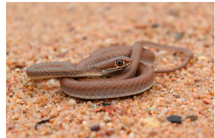
Figure 7: Ansorge's whip snake ( Psammophis ansorgii ).

only subsequent material comprises six heads and one body from Bella-Vista (Hellmich, 1957). The Tundavala specimens (Fig. 7) are the first with detailed locality and habitat. They agree morphologically with the description and the plate provided in the original description (Boulenger, 1905), and its phylogenetic affinities within Psammophis are currently being addressed (Branch et al., in prep.).