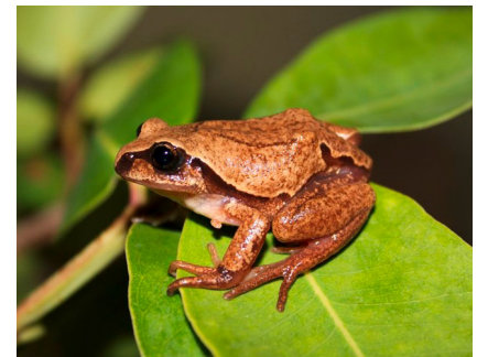
Figure 4: Anchieta's treefrog ( Leptopelis anchietae ), breeding male.

Many of the species listed in Tables 1 and 2 have been only provisionally identified. This reflects the current poor state of knowledge of the Angolan herpetofauna. Many of the provisional identifications involve wide-ranging species or species complexes in which cryptic diversity has recently been identified but for which no, or little, Angolan material was included. Other species are poorly known Angolan species, some known from very few specimens and for which the types were lost in the fire that destroyed the Lisbon Museum in 1978. These problematic species, of which some may be new to science, given the geographic setting of Tundavala, are either currently under investigation or will require further investigation when additional, often topotypic material becomes available. Taxonomic issues associated with some of these species are addressed below.