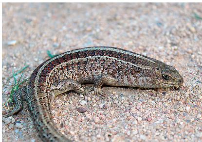
Figure 9: Hoesch's skink ( Trachylepis hoeschi ).

This fat terrestrial skink was found in montane grasslands, often near termite mounds in which it may shelter. It is endemic to Angola and Namibia, and previously known in Angola only from lowlands in Namibe province (Laurent, 1964; Haacke unpub. data ; Branch unpub. data ; Ceriaco et al. , 2016). This record constitutes an important range extension of the species onto the plateau, above 2200 m a.s.l.. Further studies will help reveal if the species is tolerant to altitudinal range, or if the upland population reflects cryptic speciation.