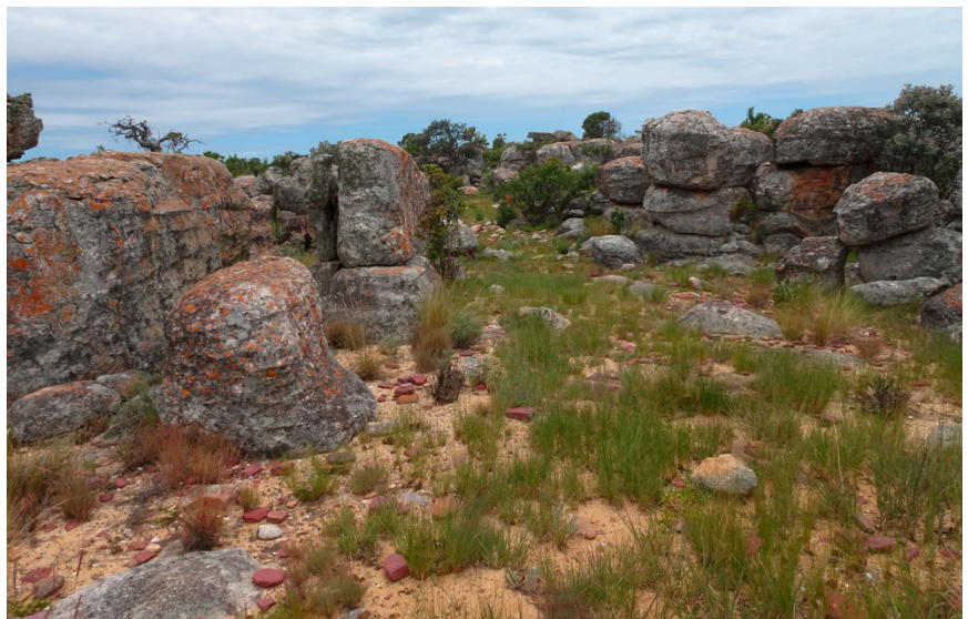
Figure 3: Weathered sandstone outcrops (rocky habitat) and associated woody and grassy vegetation at second monitoring site.