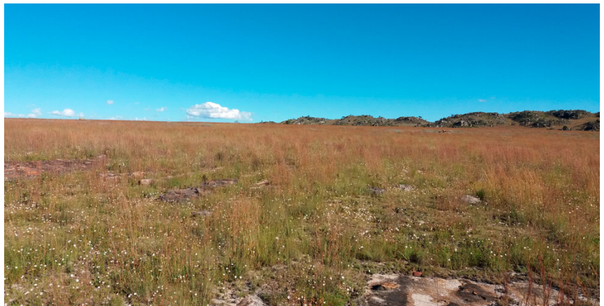
Figure 2: Montane grassland (grassy habitat) at first monitoring site.

The main goal of the SASSCAL Project’s observatories (task 210) is to monitor biodiversity to understand the effects of climate change and land use on plant communities in the long term. Several observatories have been implemented throughout Angola, including one in Tundavala. The herpetofauna is frequently cited as a useful indicator for environmental monitoring thanks to its importance in ecological functioning and its sensitivity to environmental change (Smith & Rissler, 2010). In this context, a monitoring program of the Tundavala herpetofauna was initiated in 2016. The compilation of baseline information, such as presence and absence of species and their relative abundances in the mid- and long term, is essential for the effective management of this critical region for the conservation of Angolan biodiversity. This is the first herpetofauna monitoring plan implemented in Angola. The project is ongoing, and preliminary and more relevant findings are presented in this publication.