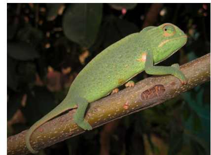
Figure 8: Double-scaled chameleon ( Chamaeleo anchietae ).

Double-scaled chameleons from Tundavala (Fig. 8) correspond morphologically to